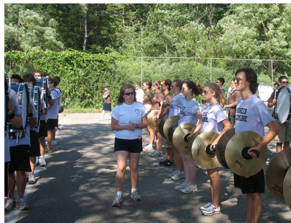
Daily drills on the tennis courts stress physical endurance, discipline and proper technique.

All students must turn in their 2010-2011 Pioneer Band Registration Form at this time.