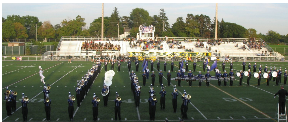
Band Camp prepares musicians for pre-game and halftime shows at home football games.

Why Do We Go Up North to Interlochen Center for the Arts? Interlochen Center for the Arts is the premiere music camp in the country, and Pioneer and Huron bands and choirs have had the privilege of sharing the facility for many years. Pioneer & Huron orchestras will be joining us in this tradition and also will attend our annual camp in August this year. More information about