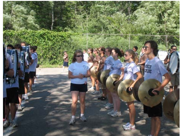
Daily drills on the tennis courts stress physical endurance, discipline and proper technique.

which will ensure you are prepared for camp. Some will pick up a school instrument; the school will provide large instruments and special marching instruments. You will also fill out information forms, receive your camp t-shirt, and sign up on the bus list. All students must turn in their 2009-2010 Pioneer Band Registration Form at this time.