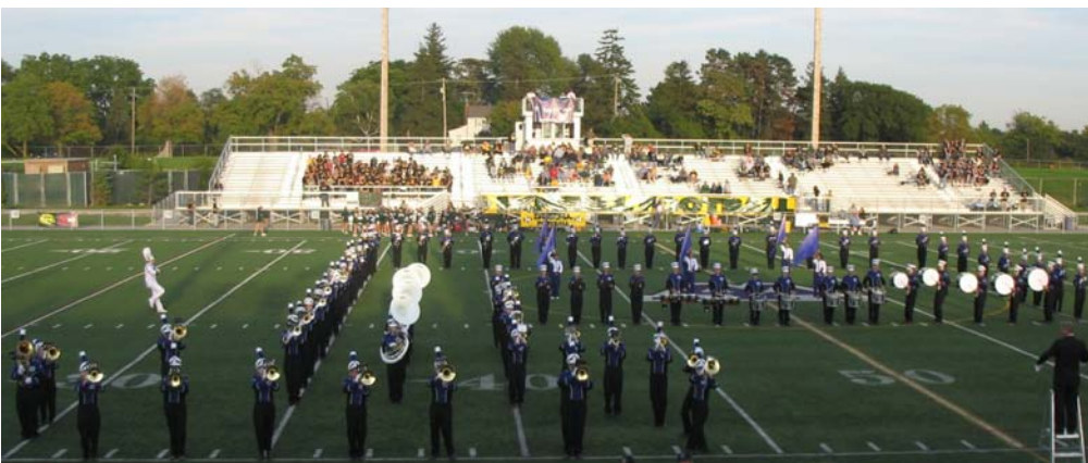
Band Camp prepares musicians for pre-game and halftime shows at home football games.

Why Do We Go Up North to Interlochen Center for the Arts? Interlochen Center for the Arts is the premiere music camp in the country, and Pioneer has had the privilege of sharing the facility with the Huron band and choir for many years. Skyline will be joining us in this tradition and also will attend our annual band camp in August. More information about Interlochen can be found at their website www.interlochen.org .