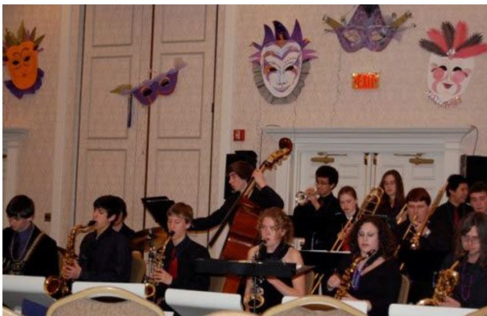
The Jazz Band offers a musical interlude between enthusiastic bidding.