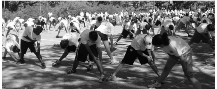
Physical preparation for Band Camp Sunday Marching Demonstration

Marching is a very demanding physical activity, and your success and ability to enjoy the season, both at Band Camp and throughout the fall, depends in a very large way on your pre-camp physical condition. To prepare for the physically demanding marching season, it is important to sustain a daily exercise program throughout the summer. Many members find running, biking, swimming, and climbing stairs very helpful.