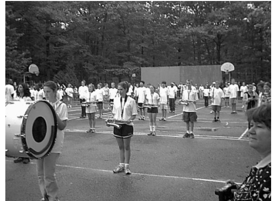
Standing at Attention