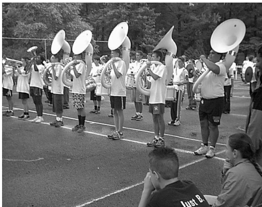
Band Camp Marching Demonstration Instruments UP

CAMP CONCERT UNIFORM: White blouses/shirts and black skirts/pants with black shoes are to be worn for the Sunday concert presentation — no jeans, shorts or t-shirts or tennis shoes, please. Wondering what else to bring? A complete packing list is available in Band Camp Bulletin No. 2 . Plan to pack your everyday clothes and don't forget plenty of socks, tennis shoes (for marching), sweatshirts, sweater or fleece jacket, pants, swimsuit, raincoat and a flashlight. Pack a sleeping bag, sheets, pillow, two bath towels, washcloths, soap, comb & shampoo, toothbrush & paste, toiletries & hygiene products, and a drinking cup. Bring clothespins (for holding music to your music stand) and a pencil for rehearsals. Bring your musical instruments (BOTH concert AND marching), and a folding music stand. ALL ITEMS SHOULD BE MARKED WITH YOUR NAME. If you wish, bring money for the Interlochen Store — gifts and snacks are available. Remember, you need to bring $10 for lunch for the bus trip TO camp AND $10 for lunch for the bus trip home!